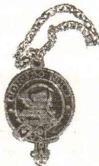
Pendant with Chain

The above items are made from beautiful pewter castings