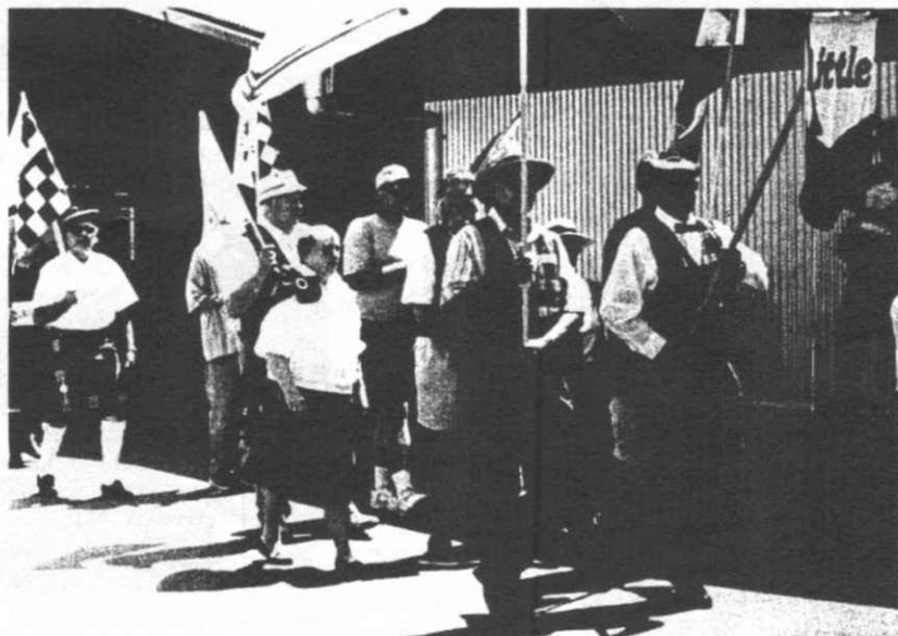
The March of the Clans, Enumclaw, July 1999.