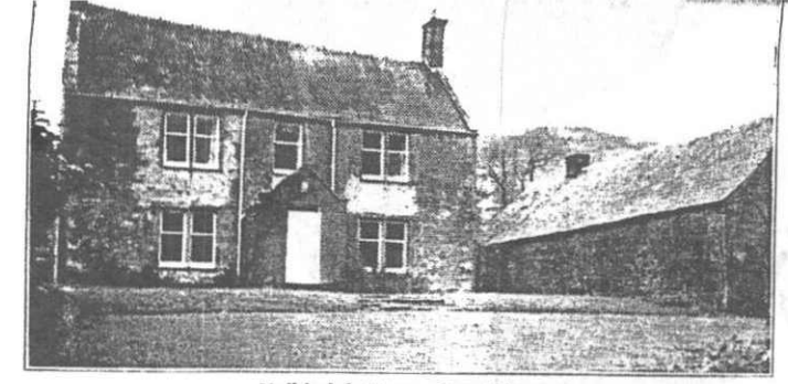
Meikledale Farm - Front View