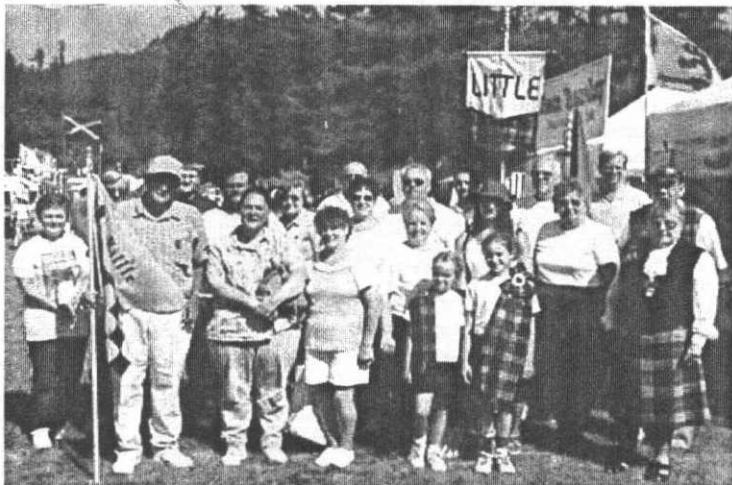
Members, family, and friends all gather at the Year 2000 AGM for a group portrait.