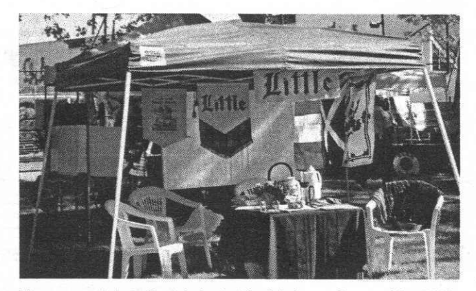
The very well done Society tent at the Mariposa Games, May 2000.