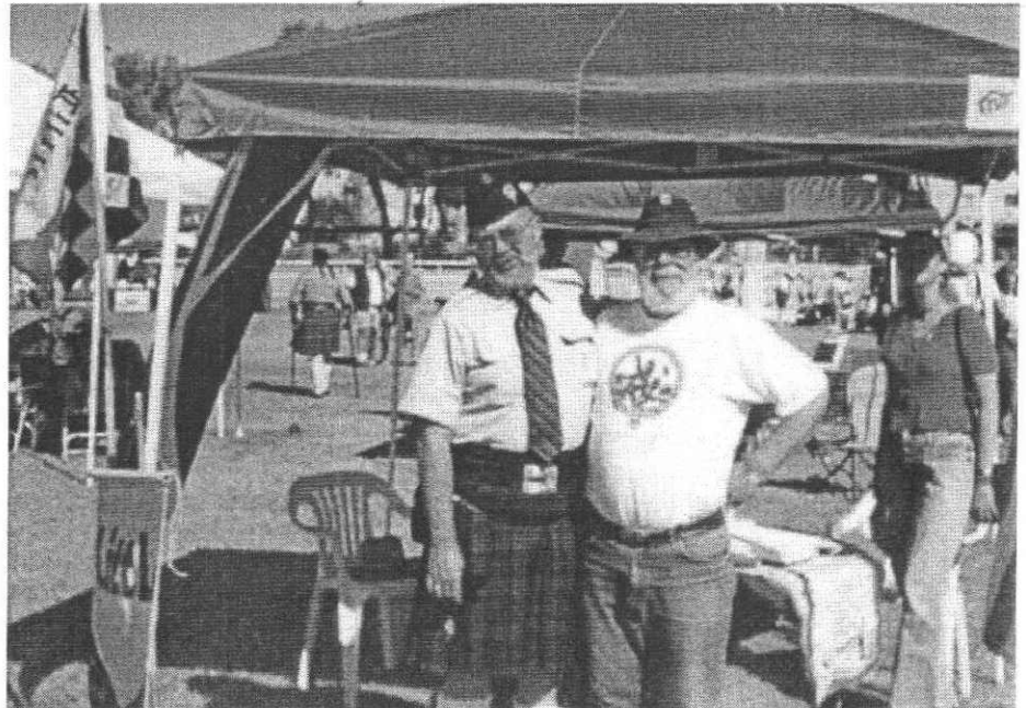
At the Tucson, Arizona Games...