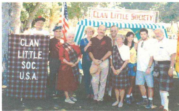
Pleasanton CA, 1994, Who knows any of these old folks?