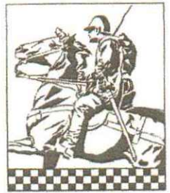
The Border Reiver