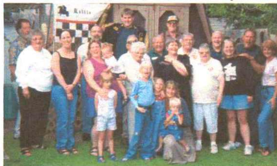
Large crowds are the norm at the Enumclaw WA Haggis feeds!