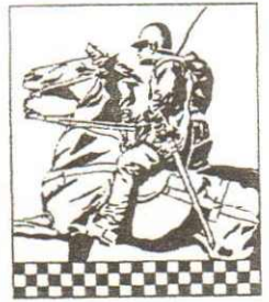
The Border Reiver

THE NEWSLETTER OF CLAN LITTLE SOCIETY, NORTH AMERICA