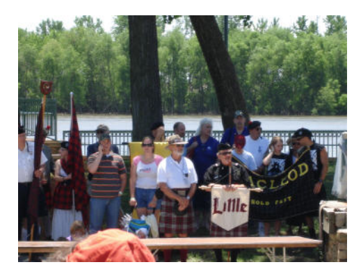
Littles, front and center, with the Missouri River as a backdrop.