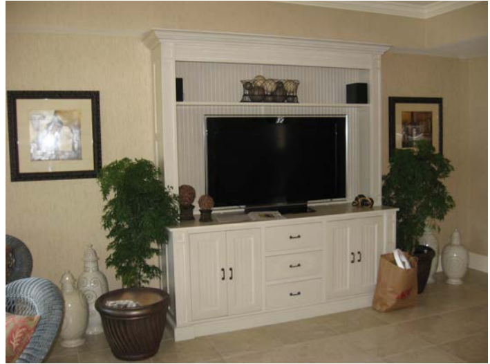
Tthis painted TV cabinet was a collaboration between himself and an old client for her beach front condo.

veneers, burls etc. All the tooling techniques both hand and motorized, as well as tool maintenance and sharpening. he still rely a lot on hand planes and wood rasps and the like. Joinery and glues and clamping techniques is a science unto itself as is the staining and finishing process.