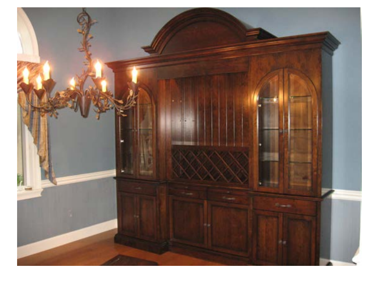
This arched-bonnet dining cabinet was built to designer specs, including a wine rack and arched doors - and interesting venture into circular work.