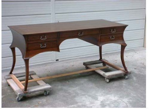
A ladies writing desk built on a modern French design. The home this piece sits in was the feature article in Architectural Design magazine,

With the furniture building you have to take in every aspect of species recognition and strengths/uses for hardwoods,