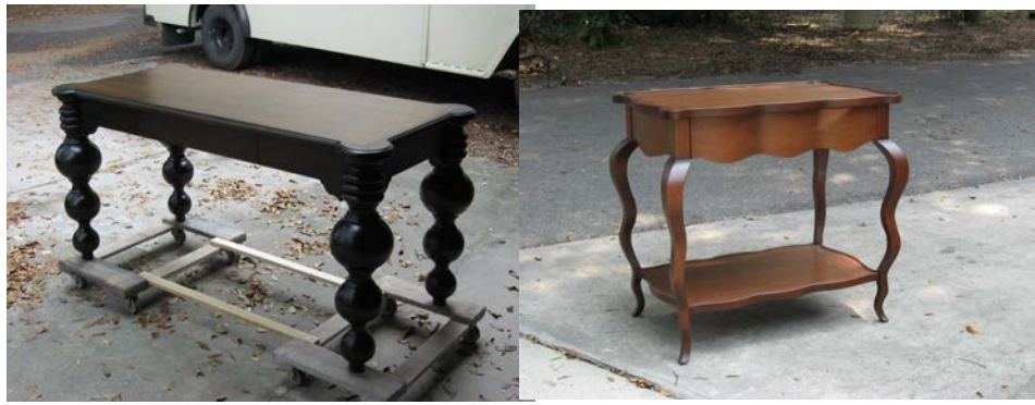
This dark walnut desk with those massive turned legs is a joint design effort between David and a client - based on an 18th century English factory seamstress table.